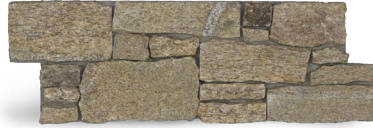
RUSTIC GRANITE Panel