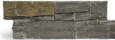
RUSTIC GREY Panel