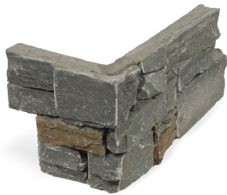
RUSTIC GREY Corner