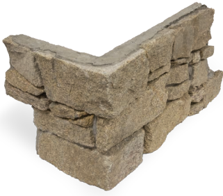
RUSTIC GRANITE Corner