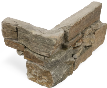
RUSTIC MICA Corner