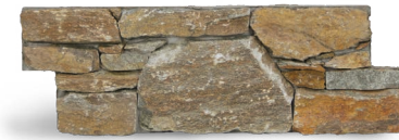
RUSTIC MICA Panel