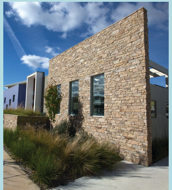
RUSTIC GRANITE Z Panel Wall Cladding

One-piece corners and matching capping are also available to deliver a stunning refined and finished look.