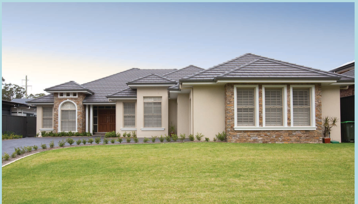
RUSTIC MICA Z Panel Wall Cladding