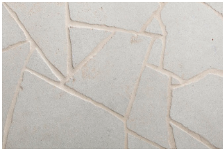
SOKERIA Crazy Paving