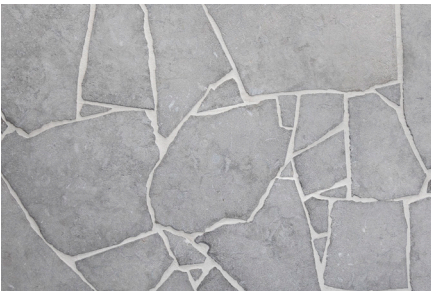
NEVOA Crazy Paving