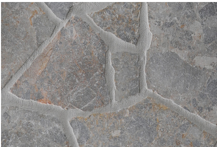
VALAS Crazy Paving