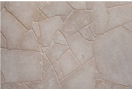
KAHVI Crazy Paving