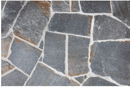
KURO Crazy Paving