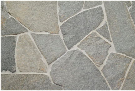
ARKKIA Crazy Paving