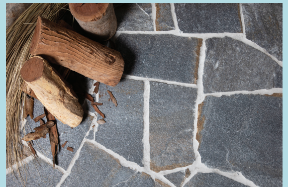
KURO Crazy paving

Delivering a fluid and dynamic overall look and feel, this paving choice can be utilised in a variety of projects, from private residential to commercial or public areas.