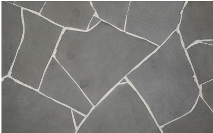
BLUESTONE Crazy Paving