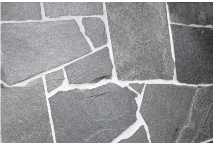
KALDUR Crazy Paving