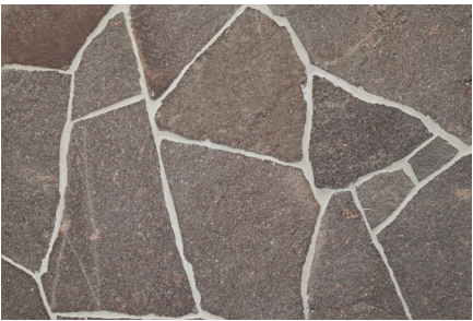
PORPHYRY Crazy Paving