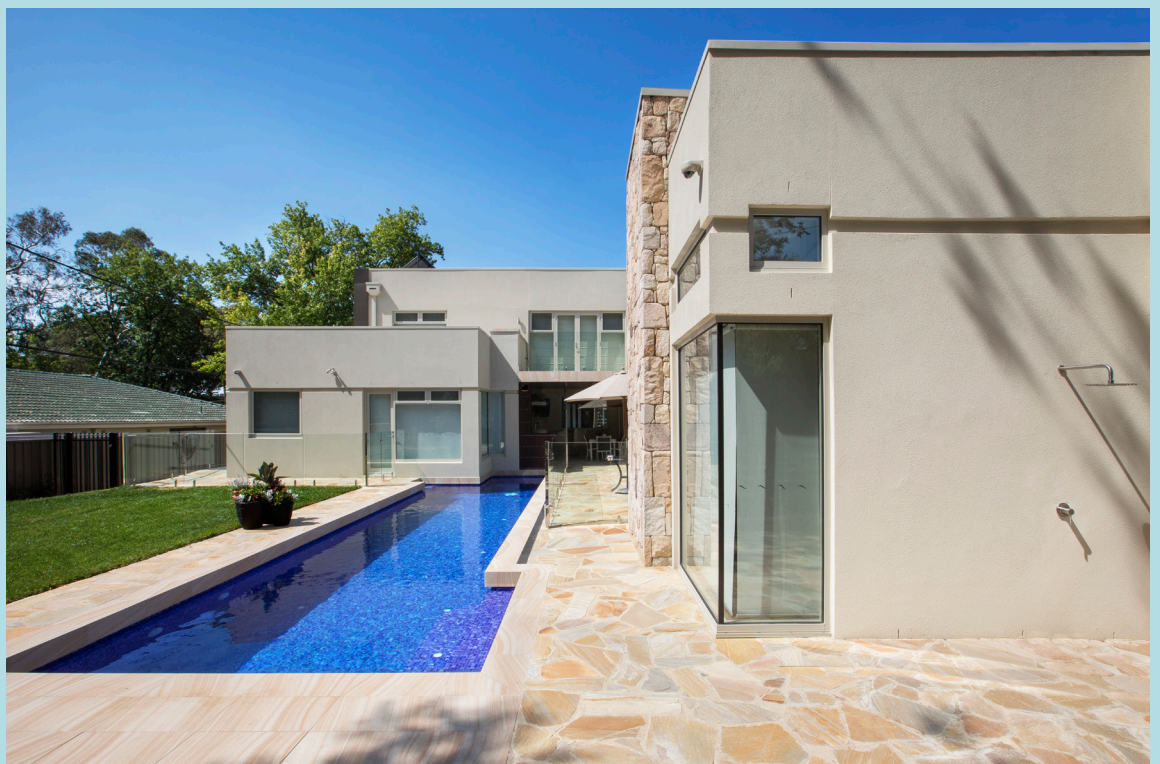
CALOR Crazy paving