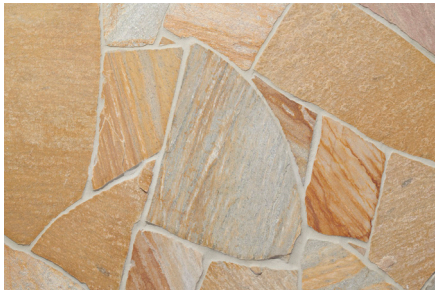
CALOR Crazy Paving